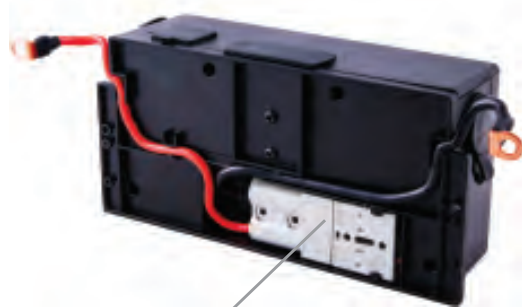
50A Anderson style connector - Input