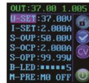
Data setting interface

Page up or page down to S-OVP, S-OCP or S-OPP place to set over-voltage value, over-current value and over-power value correspondingly; when the value is up to the setting value, output will be closed. And then press shortly the coding potentiometer to enter into the status of adjusting the numerical value you want to adjust. Turn coding potentiometer to adjust the numerical value. If you want to exit adjusting the numerical value, press shortly SET key.